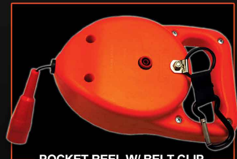
POCKET REEL W/ BELT CLIP, SAFETY BANANA JACK ALSO SHOWN